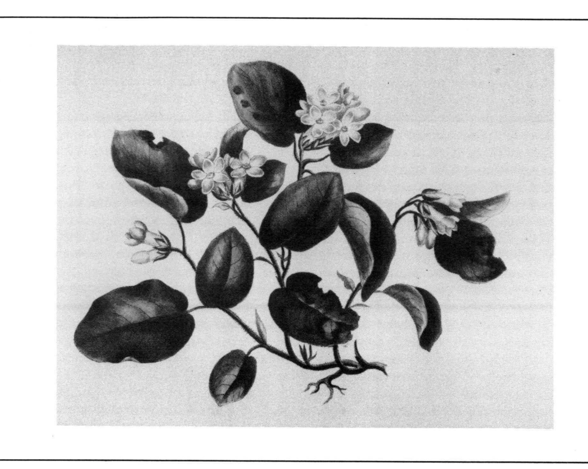
<u>Figure 2</u>. <u>Mayflower, (?)</u> hand coloured Lithograph, Maria Morris Miller.