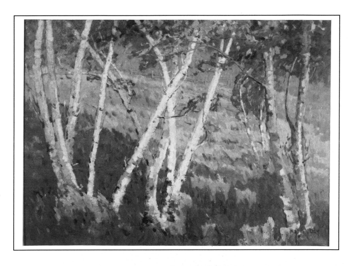
<u>Figure 3</u>. <u>Early Spring</u>, (?), Mabel Killam Day, oil on canvas.