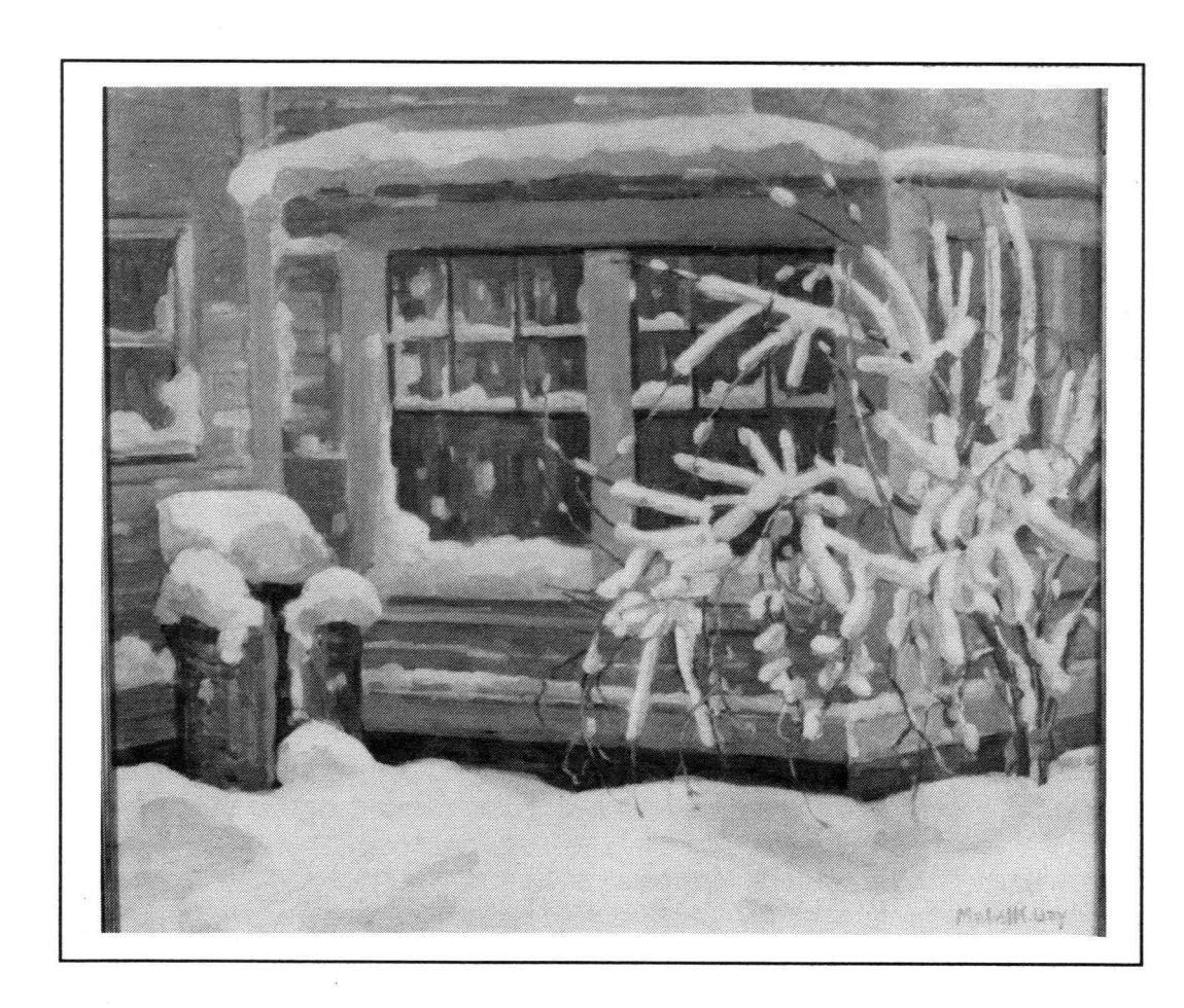
<u>Figure 4</u>. <u>House on Chestnut Street</u>, c. 1935, oil on canvas.