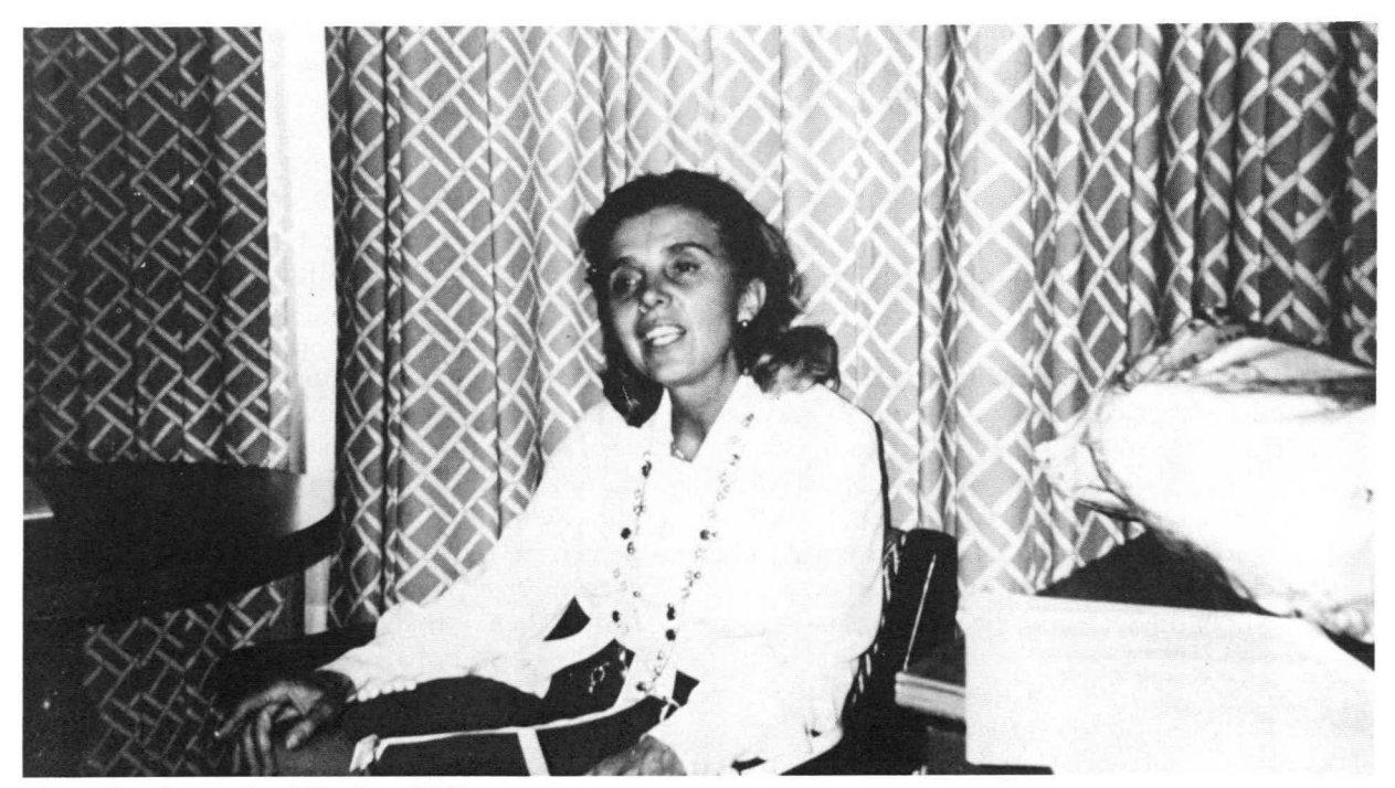
Elena Poniatowska (Mexico, 1982).

PONIATOWSKA: No, not of all women writers, but of certain ones, those who want to be that way, who want their voices to be part of the voice of the oppressed, those, that is, who are defending social causes. But there are many women who do not do that—and aren't they within their rights? Borges is probably the great-