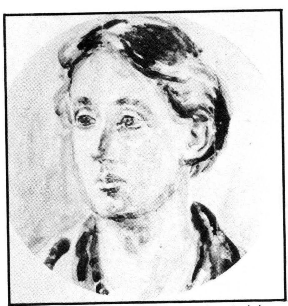
VIRGINIA WOOLF, pencil and watercolour sketch by Vanessa Bell.