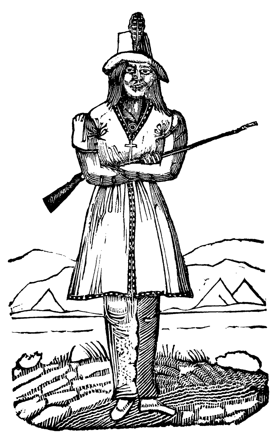
Woodcut illustration--after a sketch by Alicia Anne Jeffery facing page 224 of Abraham Gesner, <u>The Industrial Resources of Nova Scotia</u> (Halifax, 1849).