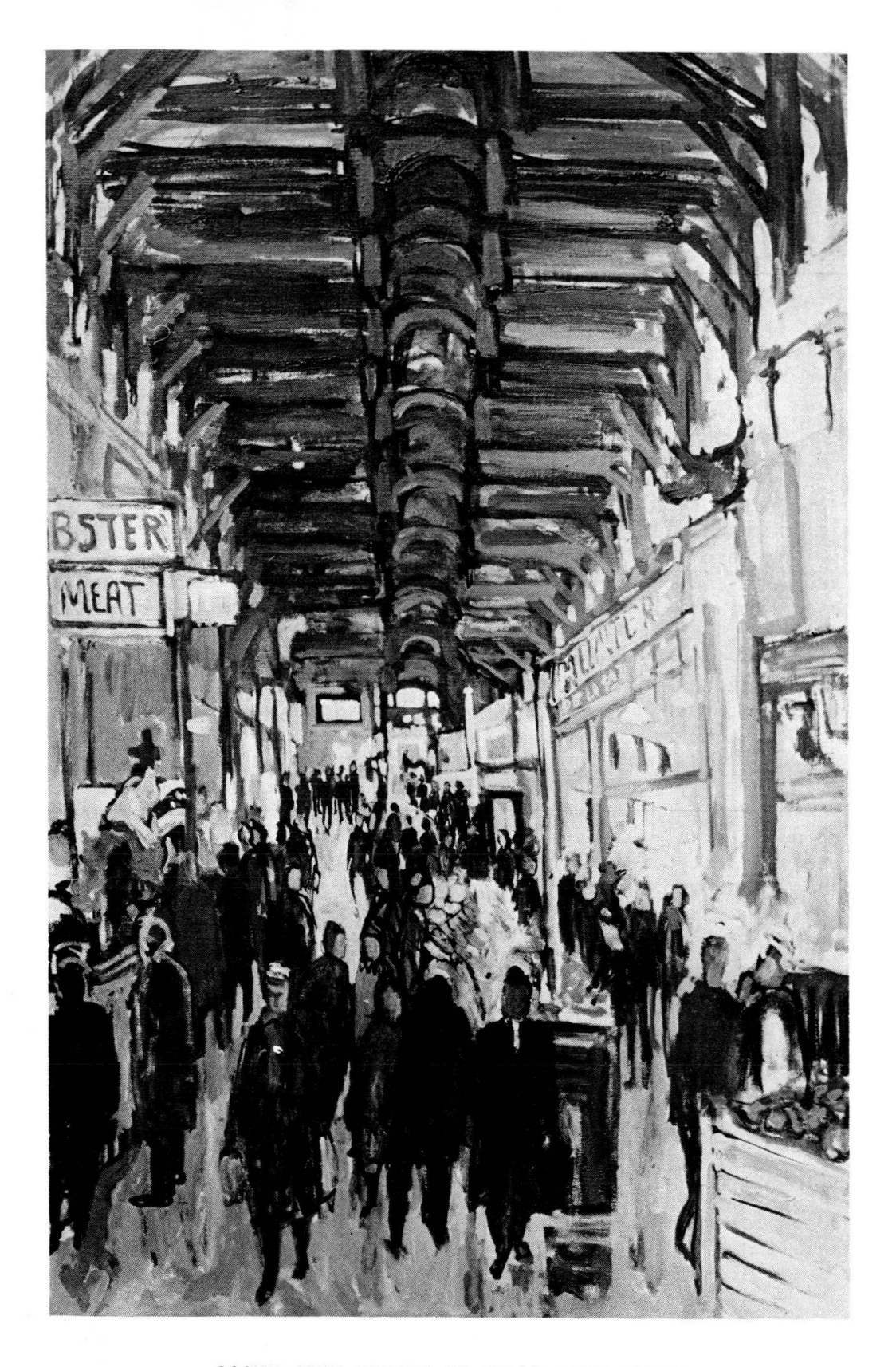
SAINT JOHN MARKET BY MOLLY LAMB BOBAK