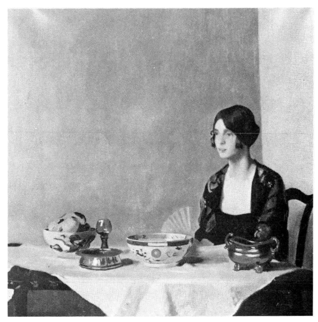
Cat. 43 Archibald Barnes, Interior