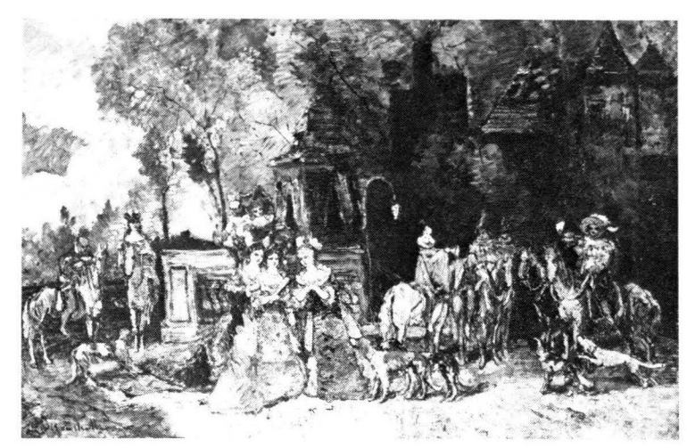
Cat. 34 Adolphe Monticelli, The Return from the Chase