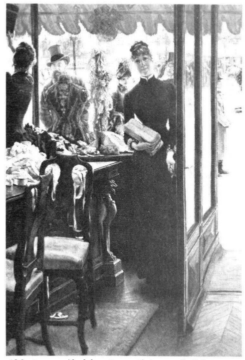
(Not available for this exhibit) James (Jacques-Joseph) Tissot, La Demoiselle au Magasin