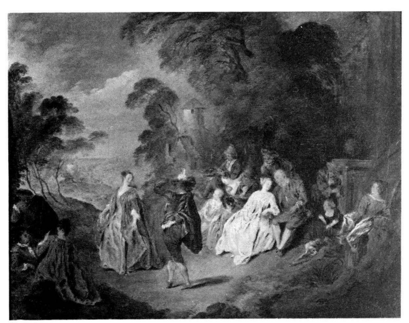
Cat. 10 Pater follower, Fête Galante: The Dance