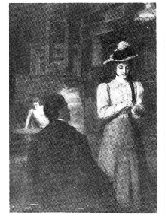
Cat. 31 William Frith, The New Model