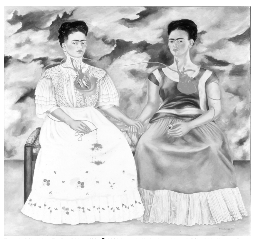
Figure 9. Frida Kahlo, The Two Fridas, 1939. © 2006 Banco de México Diego Rivera & Frida Kahlo Museums Trust. Av. Cinco de Mayo No. 2, Col. Centro, Del. Cuauhtémoc 08059, México, D.F.