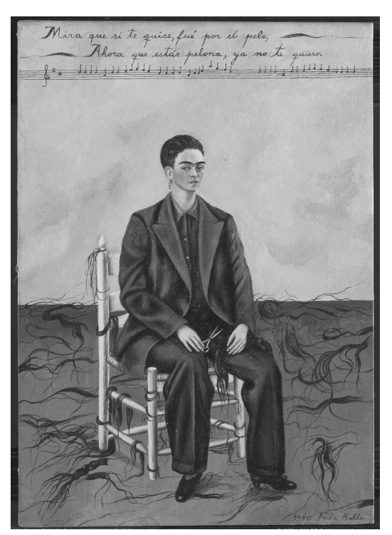
Figure 10. Frida Kahlo,Self-Portrait with Cropped Hair, 1940. © 2006 Banco de México Diego Rivera & Frida Kahlo Museums Trust. Av. Cinco de Mayo No. 2, Col. Centro, Del. Cuauhtémoc 08059, México, D.F. Digital image © The Museum of Modern Art/Licensed by SCALA/Art Resource, NY.