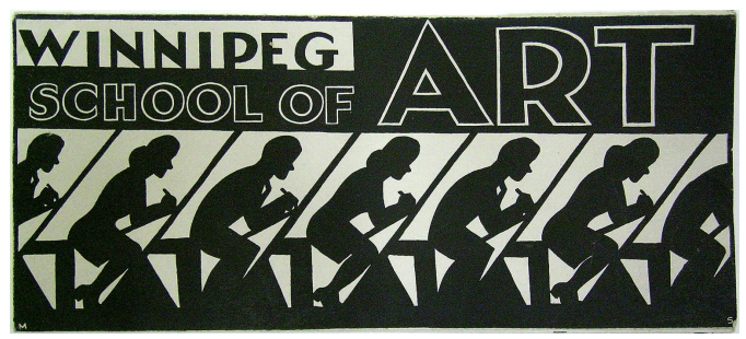
Figure 11. Cover: WSA Prospectus, 1941-42. Initials MS are on the left and right but it is not known to whom they refer.